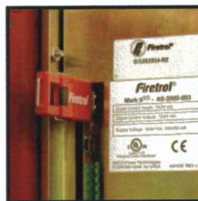
USB Host Port and Flash Disk

The controller is equipped with a built-in USB Host Controller. A USB port capable of accepting a USB Flash Memory Disk is provided. The controller saves all operational and alarm events to the flash memory on a daily basis. Each saved event is time and date stamped. The total amount of historical data saved depends on the size of the flash disk utilized. The operator can save settings and values to the flash disk on demand via the user interface.